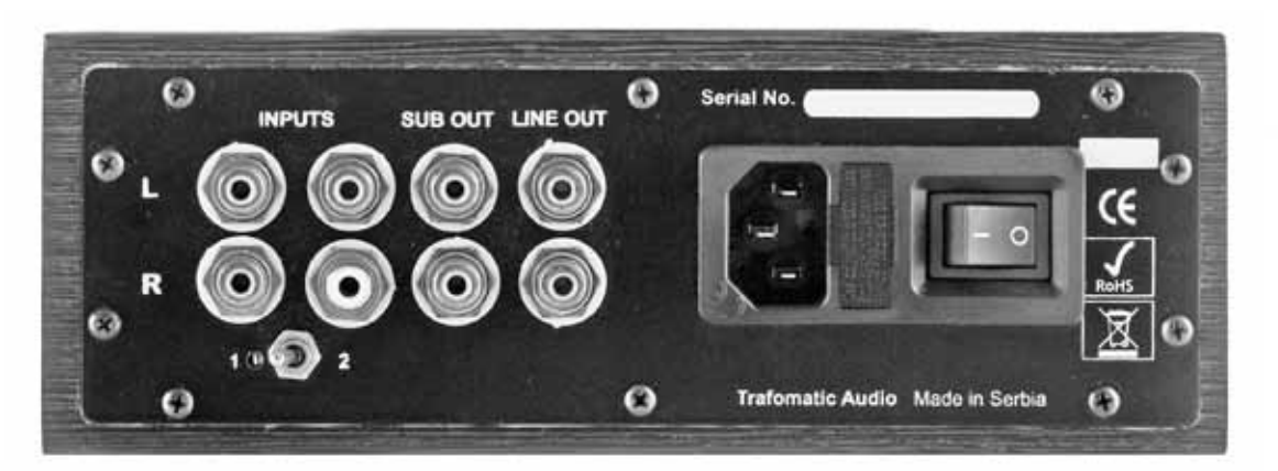
Figure 3: Experience Head One back panel