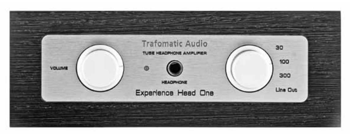
Figure 2: Experience Head One Front panel

1. Make sure that you read instructions before attempting to operate your unit.